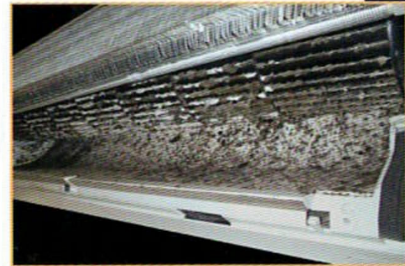
Mini-Split blower with MOLD